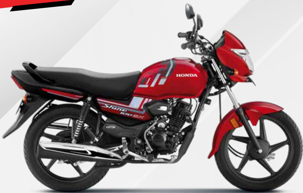
IMPERIAL RED METTALIC